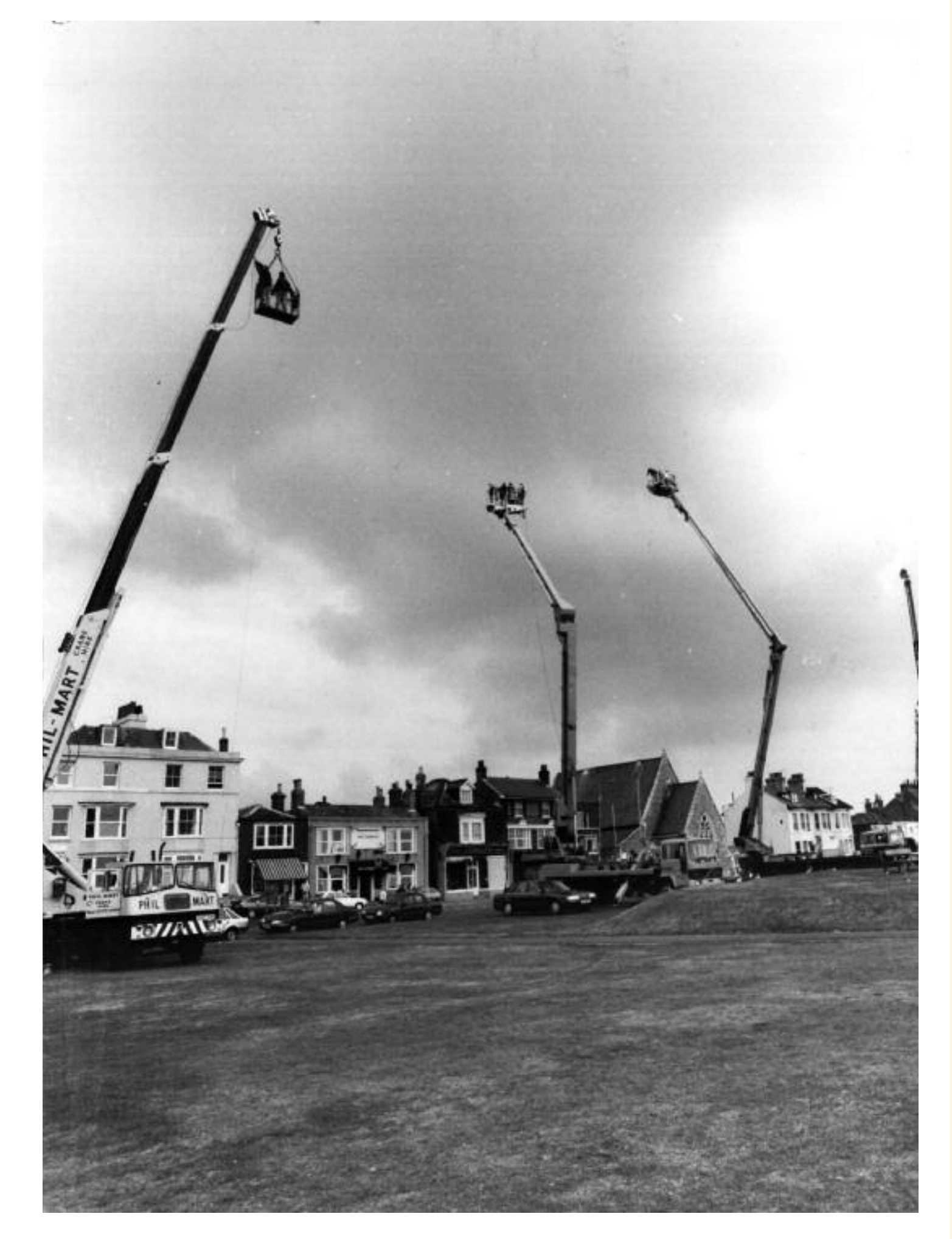
The national media set up cranes on Walmer Green to take images of the bombsite over the top of the surrounding buildings

For some people the first they heard of the explosion was on the news. The story had become widespread and the national media had started to arrive.