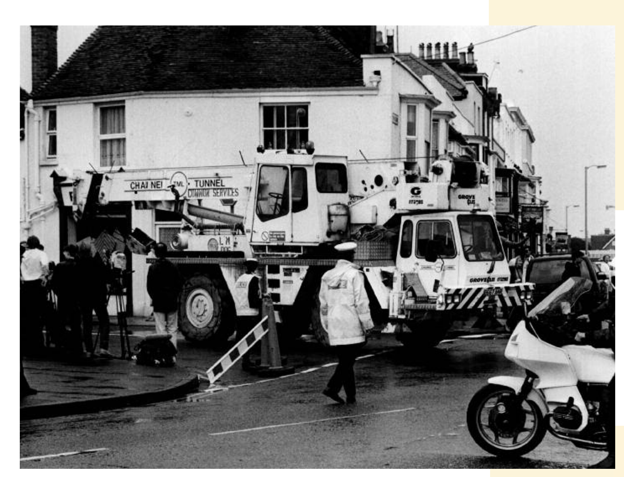
Heavy lifting equipment is brought from the Channel Tunnel works to assist with the removal of heavy rubble Picture courtesy of the East Kent Mercury

Picture courtesy of the East Kent Mercury