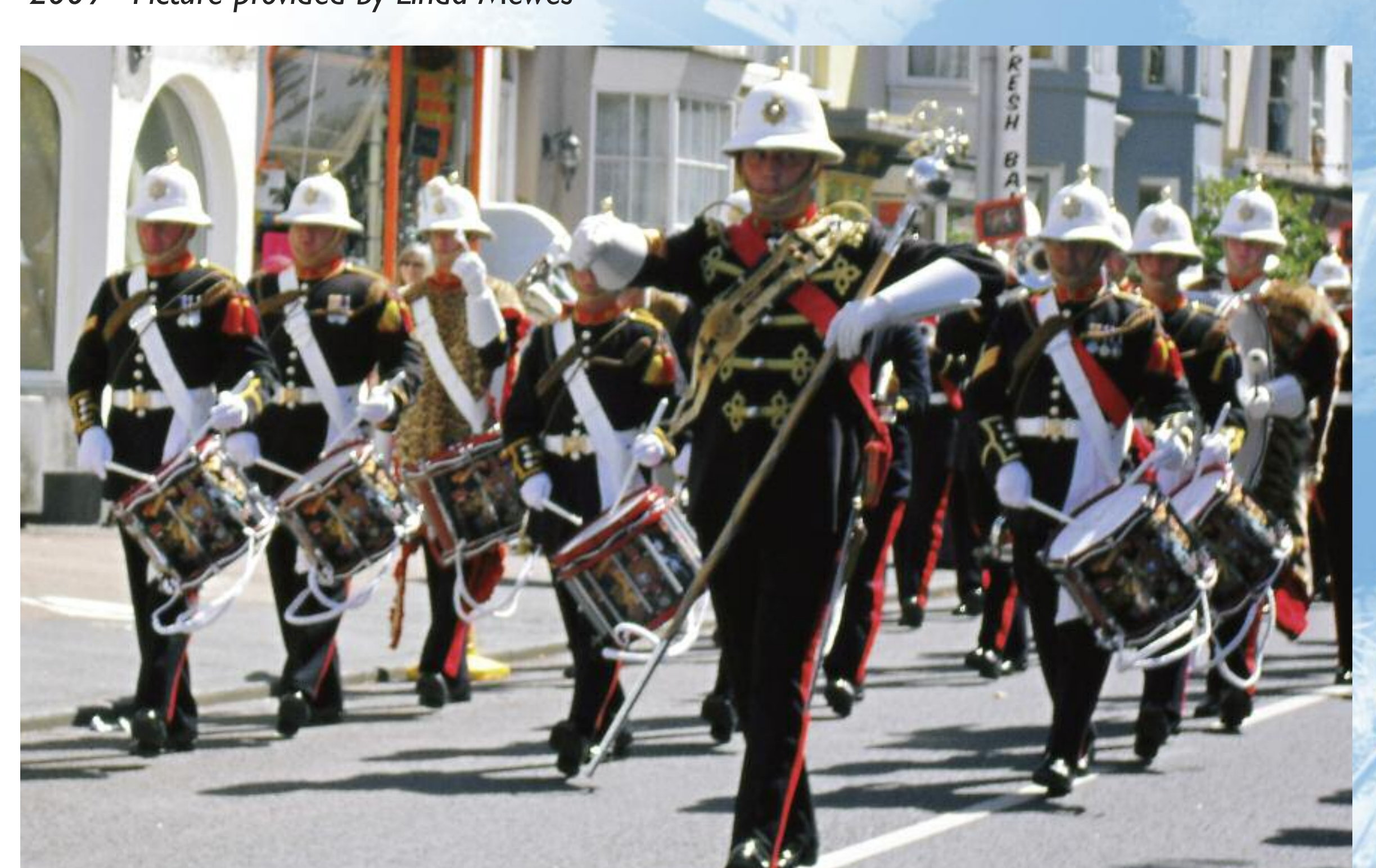
The Royal Marines march along Dover Road to return to the Memorial Bandstand on Walmer Green for the second part of the 20<sup>th</sup> anniversary concert

The concerts at the Deal Memorial Bandstand have been extremely popular since it's completion in 1993.